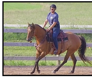
A Little Warmer Weather!