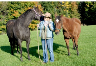
Twinkle, Star, and Rosemary

As many of you know, I will be 35 on March 5. Yes, I was a 1984 filly, but it has been a long time since anyone has referred to me as a filly (I don't care